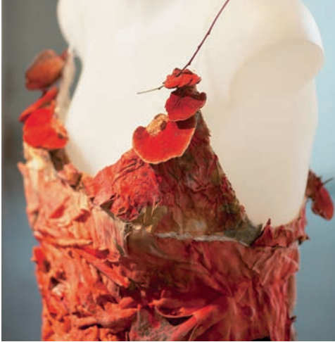
Donna FRANKLIN, Fibre Reactive , 2004–2008, orange bracket fungi